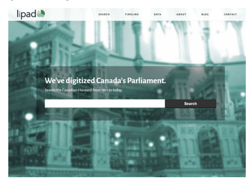
FIGURE 3 Lipad.ca Home Page