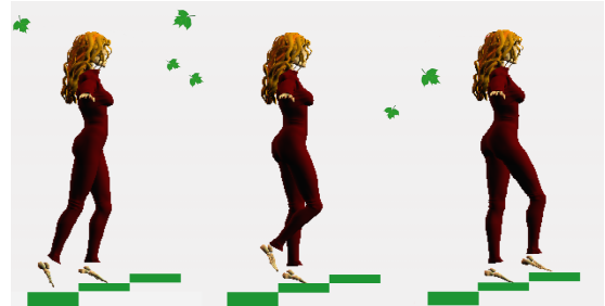
Figure 1. A synthesized stair-ascending motion.

We have introduced the concept of decomposing human motion data into motion signature and action elements. These elements are useful in the synthesis of novel motions for the animation of articulated characters.